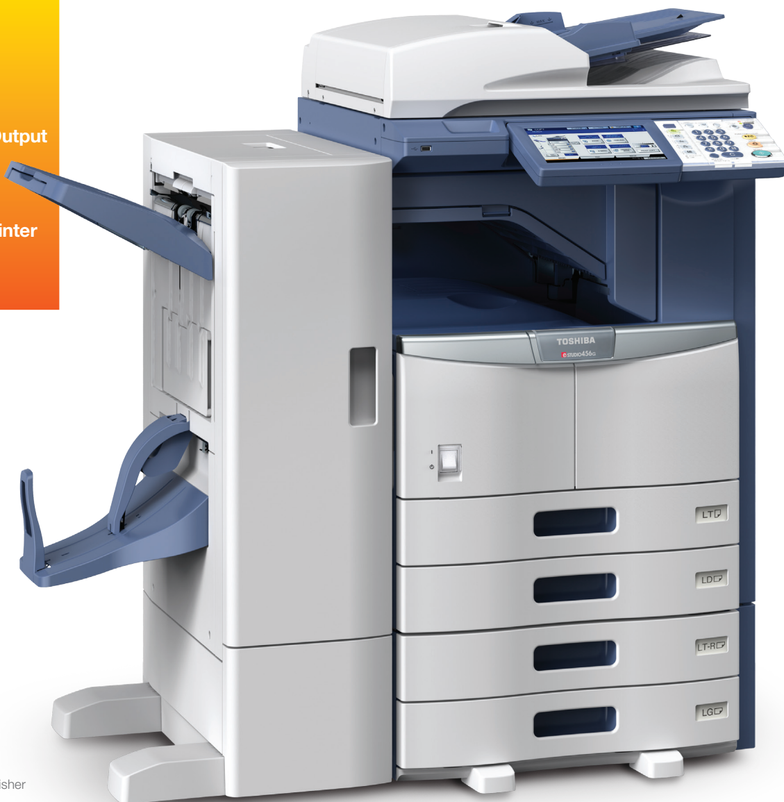
e-STUDIO456G with Saddle-Stitch Finisher