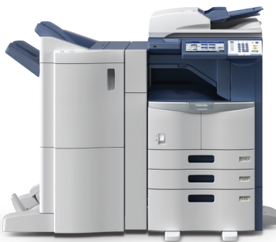
e-STUDIO456G with 2,000-Sheet LCF, Hole Punch, and Saddle-Stitch Finisher.