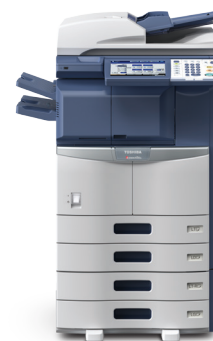
e-STUDIO456G with 50-Sheet Inner Finisher and Hole Punch.