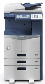
e-STUDIO456G with 2,000-Sheet LCF.