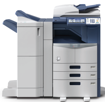
e-STUDIO456G with 2,000-Sheet LCF, Hole Punch, and 50-Sheet Staple Console Finisher.